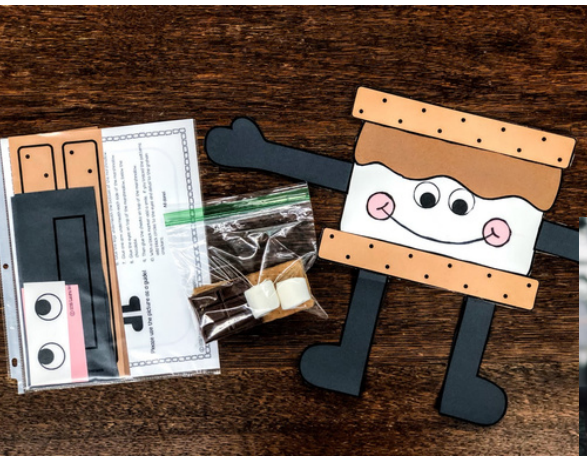
Take & Make to kick off summer