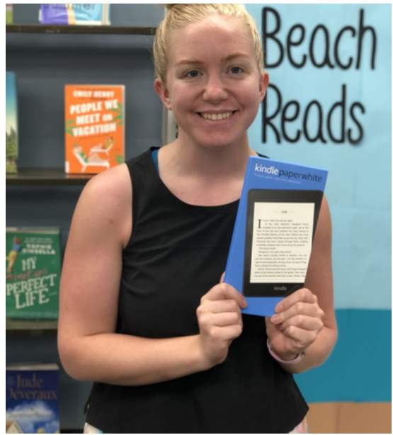
Adult winner of Summer Reading